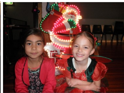
This is called the new 'Waltz Shuffle'