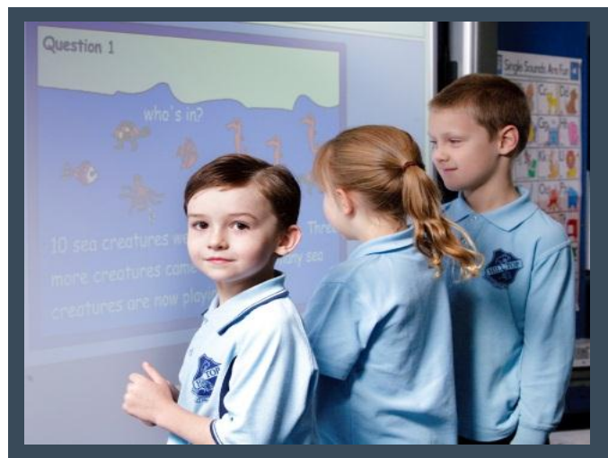
Using the Interactive Whiteboard

All year 5 students were given the opportunity to take two special notes home earlier this term to nominate themselves as potential leaders for next year. All students successfully nominated need to prepare a speech to convince the rest of the school as to why they should be considered before a voting process takes place. These speeches will be delivered to the rest of the school at a special assembly in the school hall on Monday 3 rd December at 9:10am. All parents are welcome to attend this assembly.