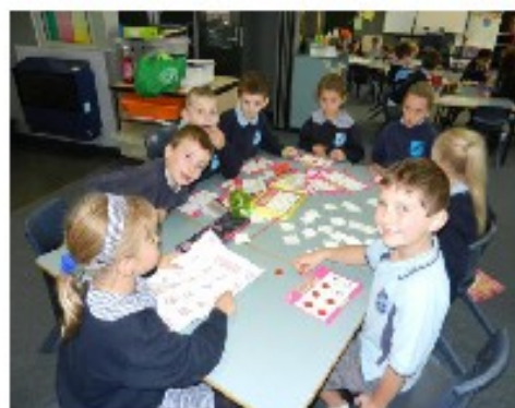
Adding numbers and playing Bingo.