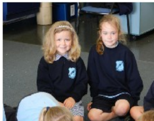
Playing 'Build 'Em Up' Maths Game.