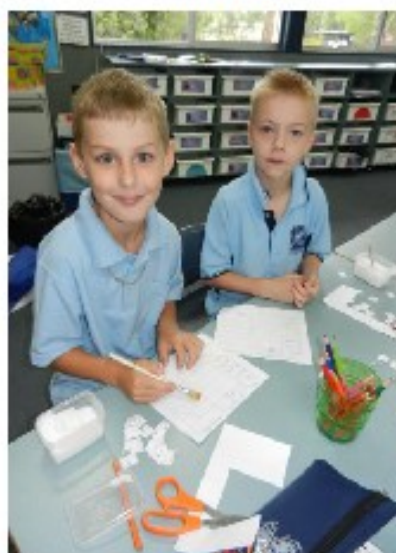
Learning about the 'am' family.