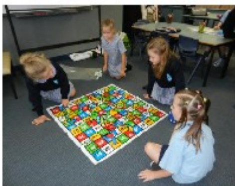
Learning to work cooperatively in groups.