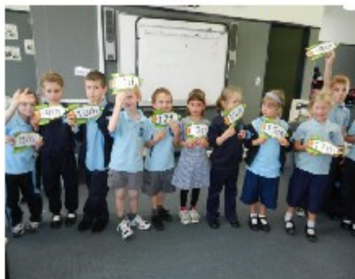
Maths - putting numbers in order.