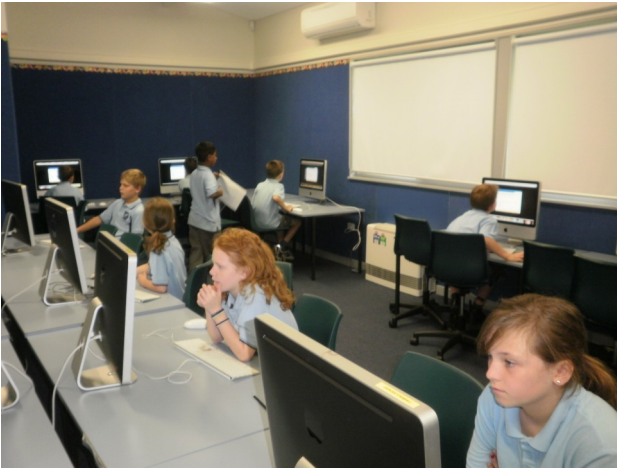
In the Computer Lab