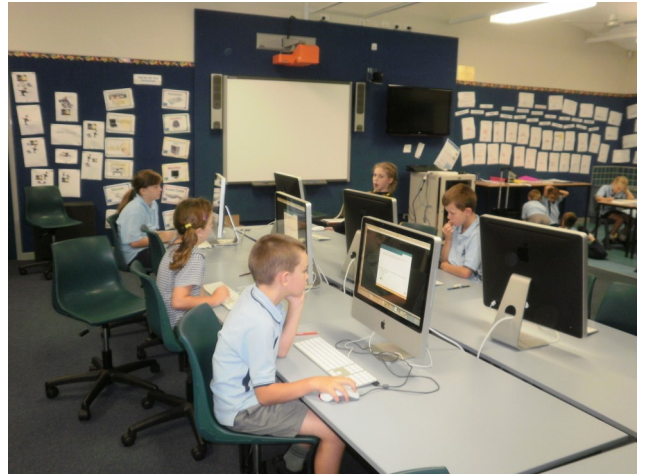
Mapping and learning about Atlases