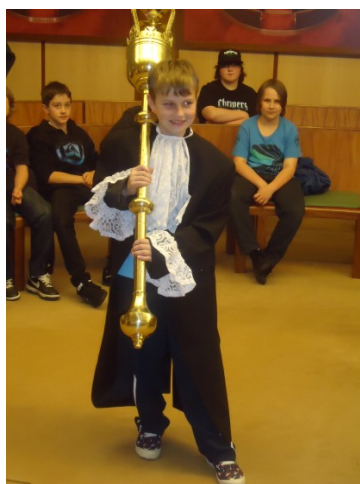
Dressed up for a role-play at Parliament House