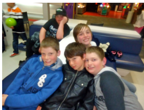
Having a fun night bowling