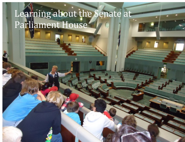
Learning about the Senate at Parliament House