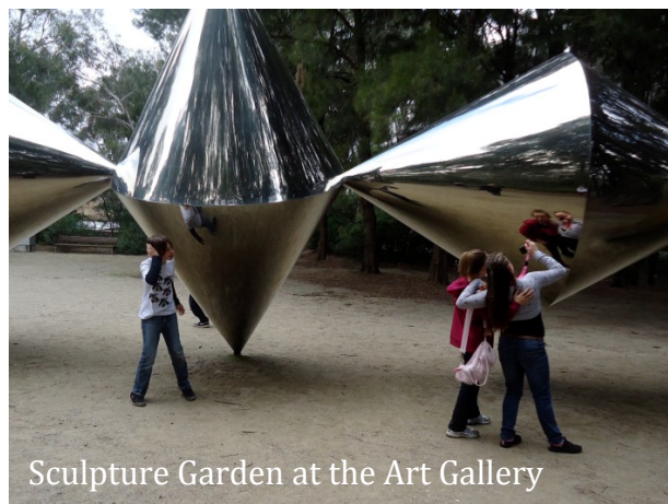
Sculpture Garden at the Art Gallery