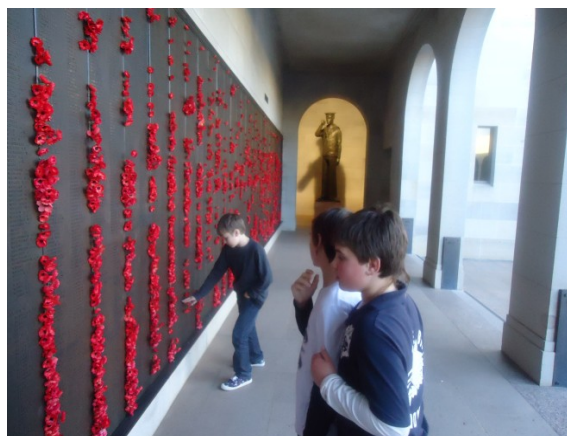
The Tomb of the Unknown Soldier and Remembrance Wall at the War Memorial