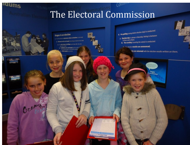
The Electoral Commission